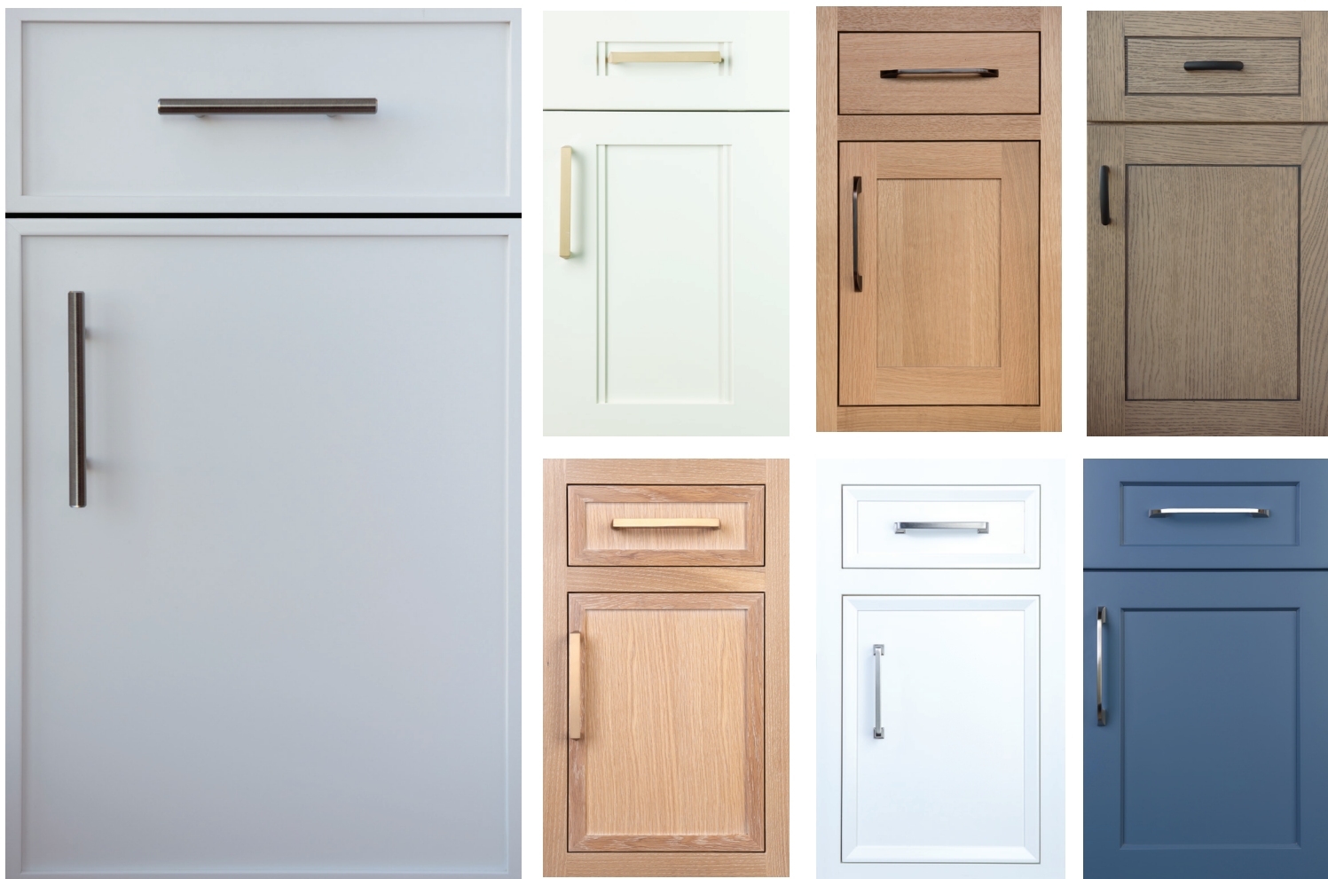
(L-R) 1. Millbrook Full Overlay | Maple Garden Gate 2. Catalina Full Overlay | Maple White Sand 3. Quaker Flush Inset | Rift Cut White Oak Natural 4. Transition Full Overlay | Rift Cut White Oak Driftscape 5. Millbrook II Flush Inset | Rift Cut White Oak Montane 6. Chatham Flush Inset | Maple White 7. Newport Full Overlay | Maple Springhouse

Transitional style is a marriage of traditional and contemporary styles, finishes, materials, and hardware.