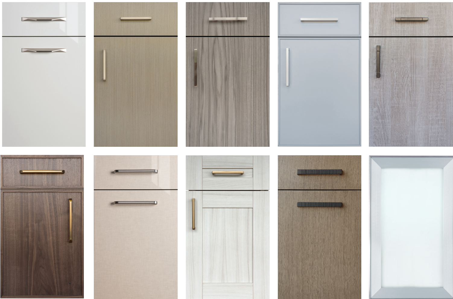
(L-R) 1. Expedition Full Overlay | Radiance Hi Gloss Blanco 2. Contempo Full Overlay | Nordic 3. Summit Full Overlay | Light Gray Woodlands 4. Vesta Full Overlay | Maple Stone 5. Strata 1 PC Full Overlay | Barn Oak 6. Millbrook Full Overlay | Walnut Natural 7. Journey Full Overlay | Radiance Hi Gloss Textile Cashmere 8. Strata 5 PC Full Overlay | White 9. Allegro Full Overlay | Weathered Shore 10. Element Full Overlay | Natural Aluminum

European design ideas, like clean lines and subtle textures, have a strong influence on American contemporary style.